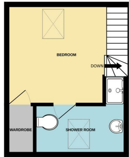
1ST FLOOR 20.9 sq.m. (225 sq.ft.) approx.